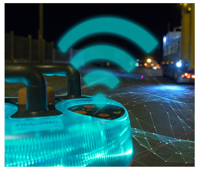
A careful and well thought out traffic management plan will create safe zones to allow employees to carry out essential works in a safe environment. However the potential of an accidental or deliberate incursion from road users still remains which is why IIPAWS is needed.